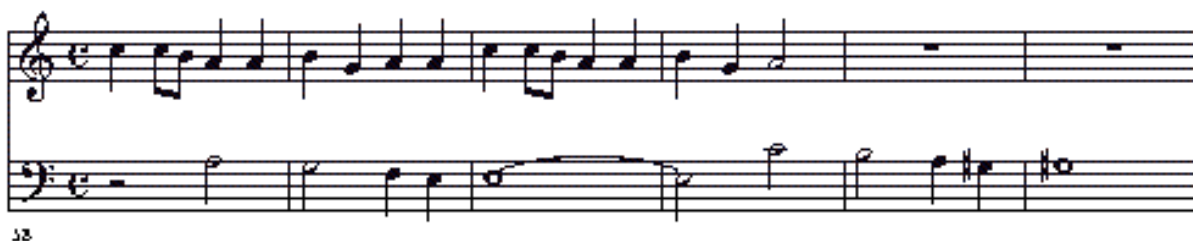
Example 2: Oboe and Euphonium melodies

This final section represents the immense joy experienced by the person as a bright light gradually appears at the end of the tunnel. All of Moody's subjects mention its “indescribable brilliance.” He goes on to say, “The love and the warmth which emanate from this Being to the dying person are utterly beyond words and he feels completely surrounded by it and taken up in it, completely at ease and accepted in the presence of this Being.”