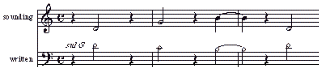
Example 4: harmonics on the bass G string

Players assigned to make a “low moaning” sound in the opening measures should imagine being in severe, excruciating pain. The percussion boxes, beginning in m. 4, should conjure up boding fear and dread of the unknown. Beginning in m. 6, the trombone glissandi should be performed slowly. If there is more than one player to a part, each should go at his/her own rate of speed once the boxed notation is reached.